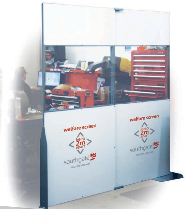
Welfare Walling System

Easily installed in warehouses, offices, workshops, restaurants, hotels and other key areas with employee or customer footfall.